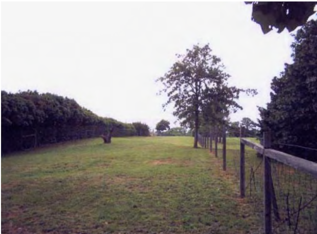
Looking North from west side of Eastern Parcel