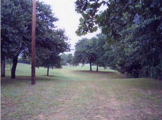
Looking east along south side of Property with house