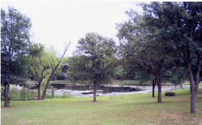
Looking southeast across Pond from near front Gate