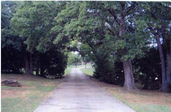
Road leading down to house