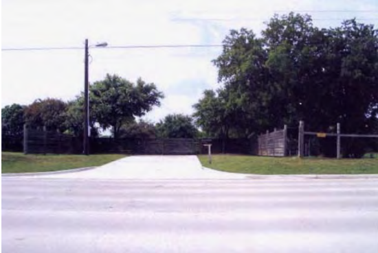
Entry gate to Eastern Property