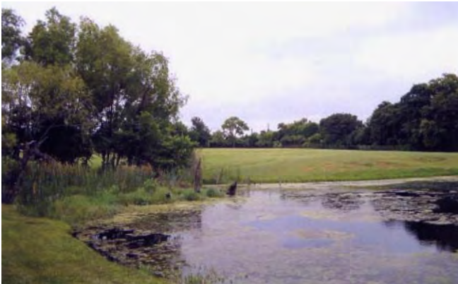
Looking to NEC of Eastern Property across Pond