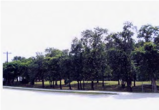
Frontage on Gerault (entry drive to western property already stubbed out)