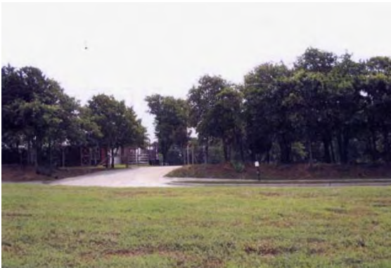
Existing Entry to western property